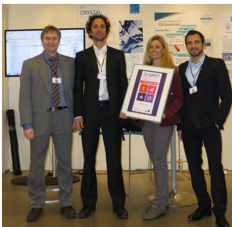
Figure 2-1: Team with the Exhibition Award

The major event was the ARTEMIS-IA Co-Summit in Stockholm. CRYSTAL had a booth presentation together with a presentation in the speaker's corner. At this event CRYSTAL won the ARTEMIS Exhibition Award for the best project communication.