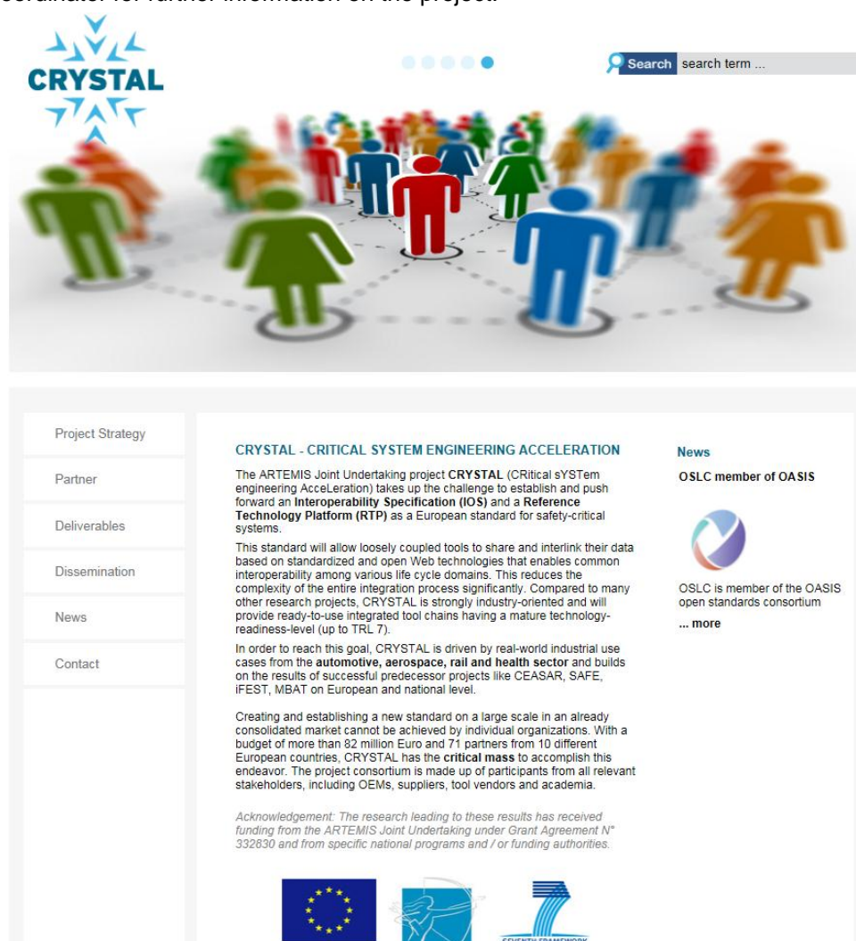
Figure 2-2: CRYSTAL Homepage

The CRYSTAL Homepage provides information of the project and its activities. A download area has been established for additional information like the project leaflet, project poster, newsletter and public deliverables. The Homepage will be updated on a regular basis with actual information in the news section and projects activities performed. The website will be a central communication element. The website is accessible via www.crystal-artemis.eu and features many aspects of the project and the continuous work performed. Visitors of the homepage have the possibility to download public deliverables, newsletters and to contact the coordinator for further information on the project.